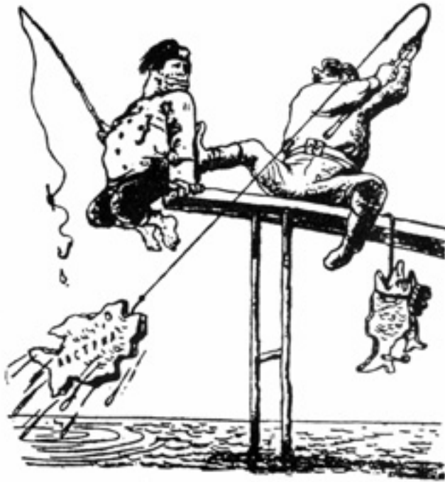
A Soviet cartoon published in an official government newspaper, 28 March 1938. It shows Hitler and Mussolini fishing. Hitler has just caught Austria.