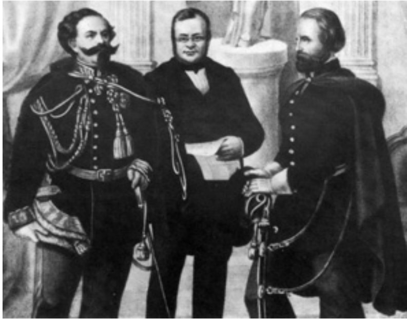
A painting from the 1860s of Victor Emmanuel II, Cavour and Garibaldi.